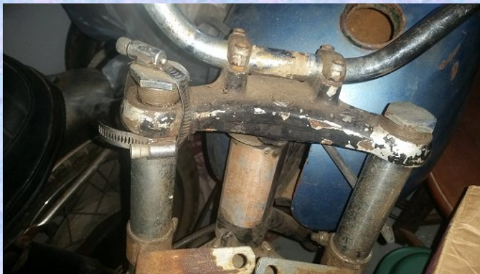
Bodge du Jour: I guess if it gets you down the road...