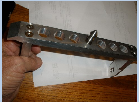
Seat bracket fits like a watch piece. Beautiful !!!