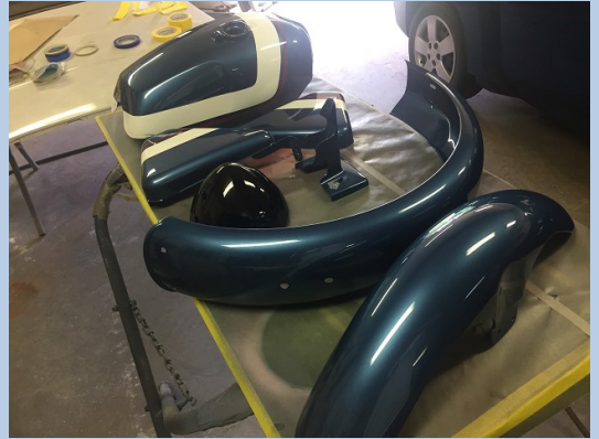
A reverse JPN theme for next Norton project. Frame is silver.