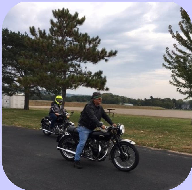
Everyone loves riding Nortons, even man's best friend .