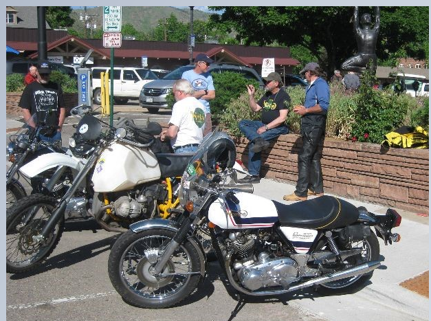
Some nice bikes made the ride as usual