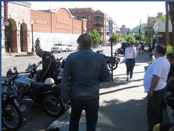
OBR is always entertaining, there were girls to watch as well as bikes