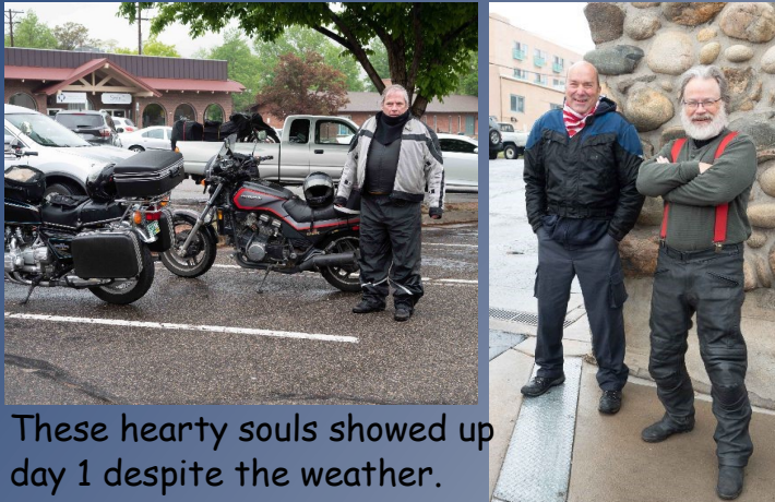
These hearty souls showed up day 1 despite the weather.

This year's OBR was a 2 day event due to some miserable weather on the original ride day. A week later the weather was perfect for a ride in the Rockies.