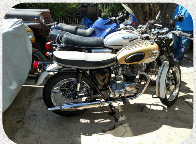
These are a few of Jesse's completed projects.