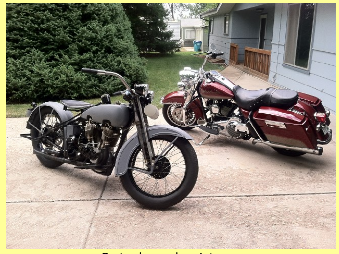
Gertrude needs paint