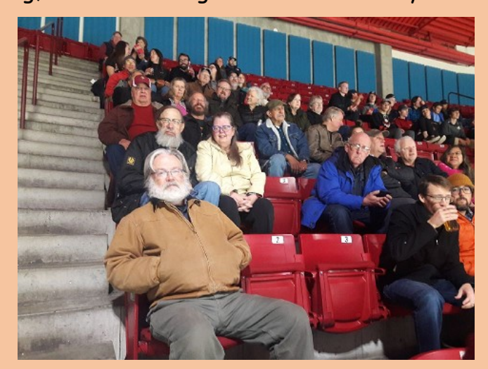
Norton lovers enjoying hockey

The Pioneers got off to a slow start which was a concern. They were on a 6 game winless streak. But, in the second period they woke up and never let off the gas. Very exciting, and as usual a good time was had by all.