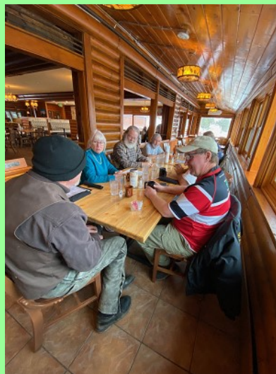
New year's gang