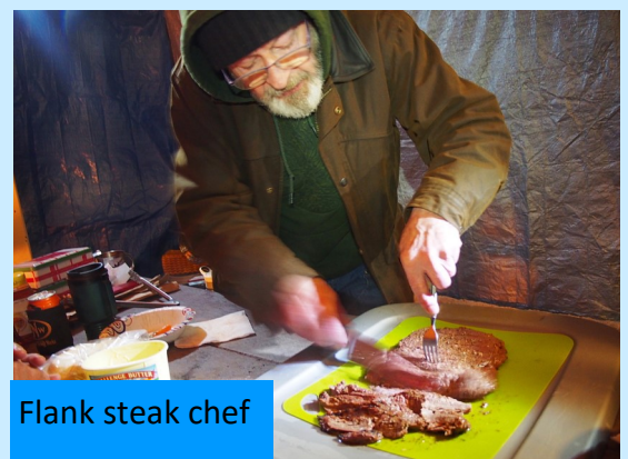
Flank steak chef