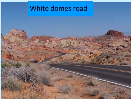
White domes road