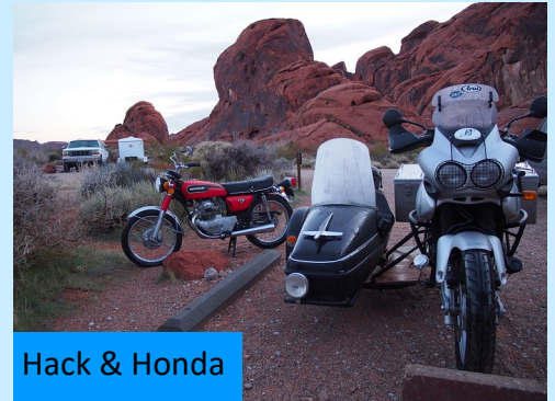
Hack & Honda

But it's a nice winter getaway about seven hours' drive west from Grand Junction.