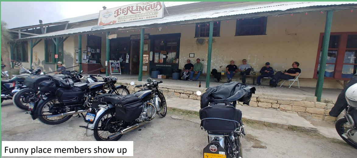
Funny place members show up