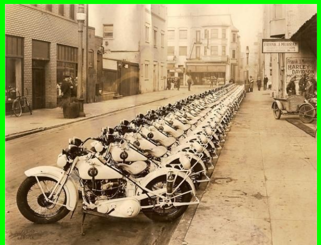
1930 LAPD Harley VL motorcycles