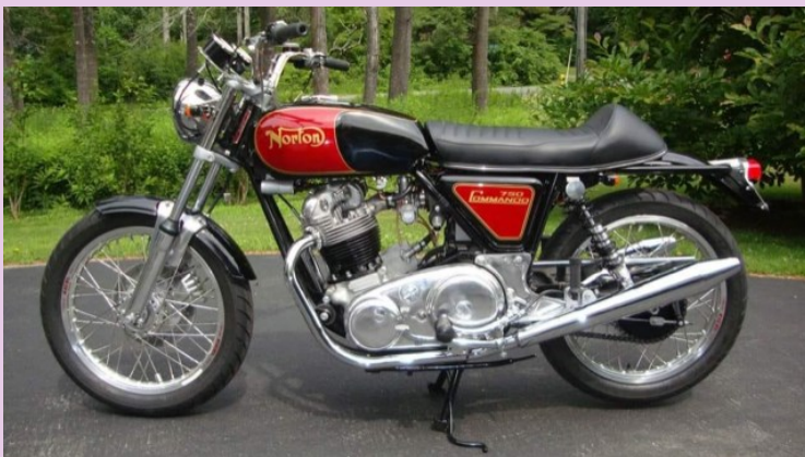
A shiny Norton

We took an informal poll of members at Lincoln's Roadhouse the other day, and we will be holding the traditional gift exchange at the Banquet. You are not required to participate. If you do, start thinking about an item that would have appeal among the membership and their partners. It doesn't have to be motorcycle parts. In light of inflation, I think $25 is probably a fair guideline these days. No gag (i.e., worthless) gifts, please.