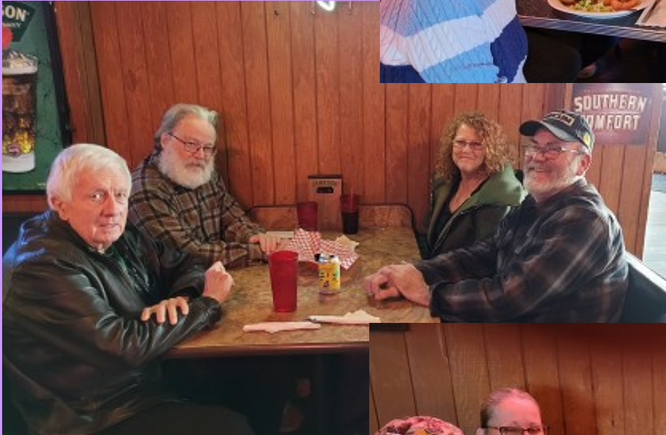
Plus Good Food