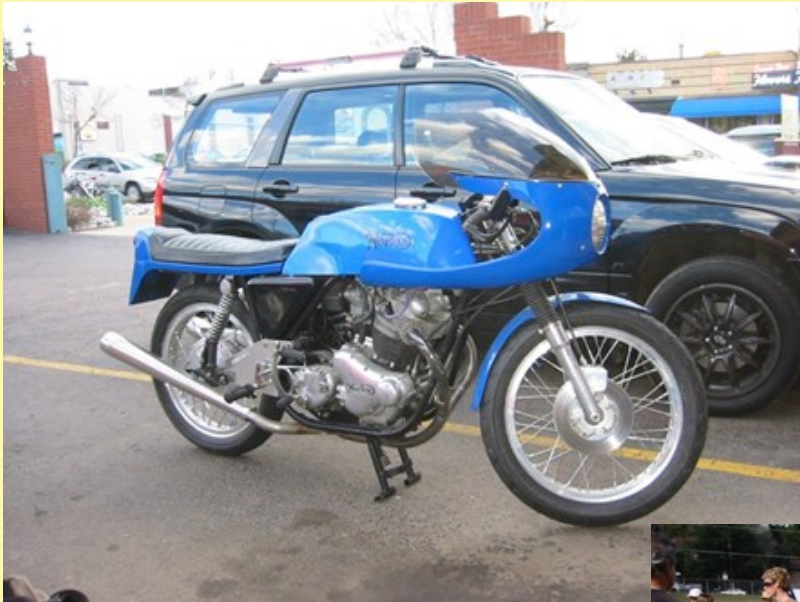
The Dunstall Commando in 2007