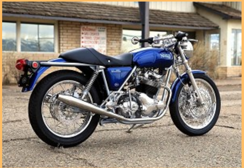
A Colorado Norton Works bike