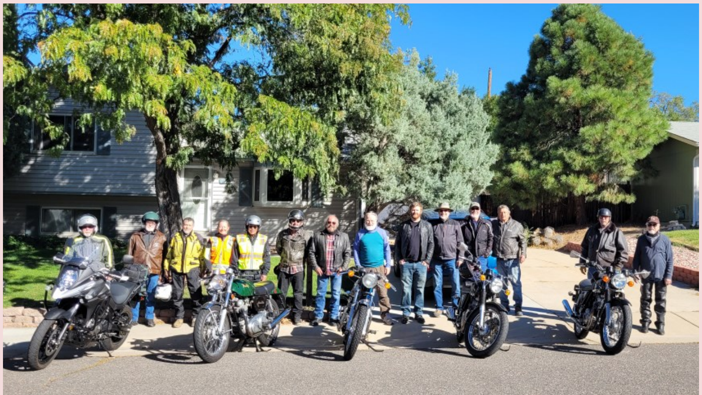
Plains Ride Group 2023