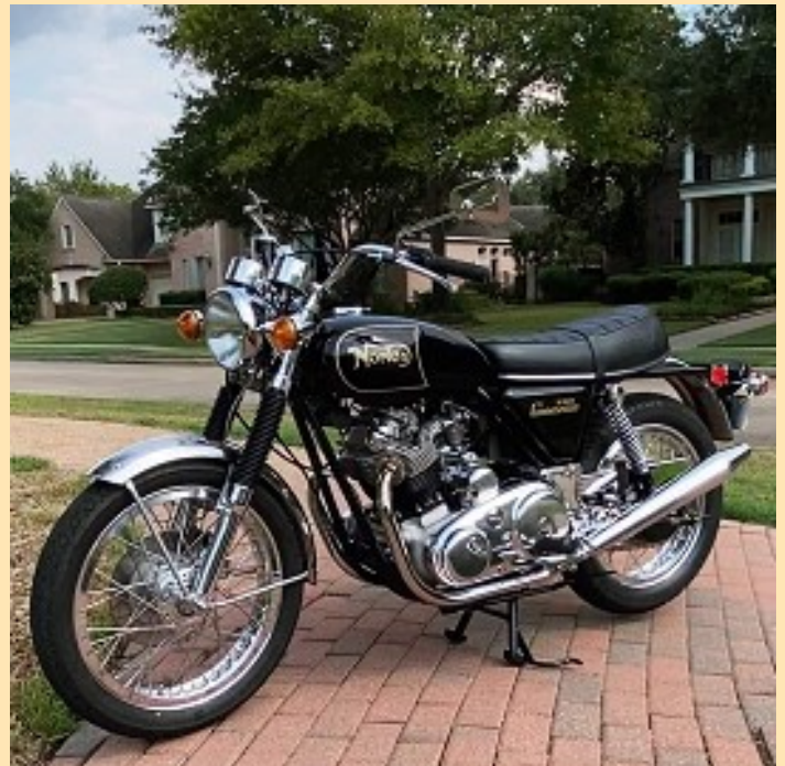
This bike is up for auction 1992 Norton F1 Sport (handh.co.uk)