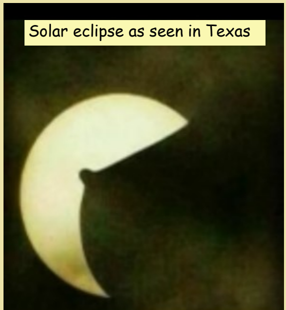
Solar eclipse as seen in Texas