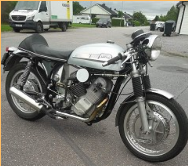
Swedish Hedlund V1000