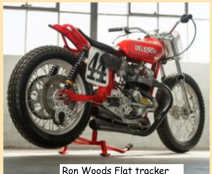
Ron Woods Flat tracker