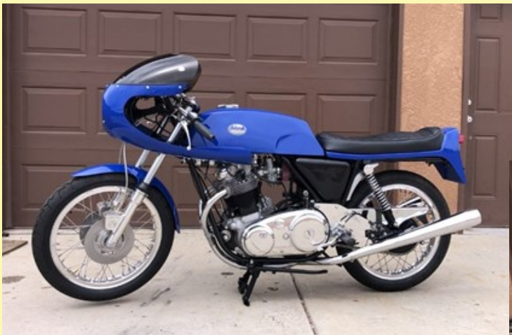
The completed restoration, and I have named her Ol' Blue!

Editor's note: More to come next month about Frank's amazing restoration.