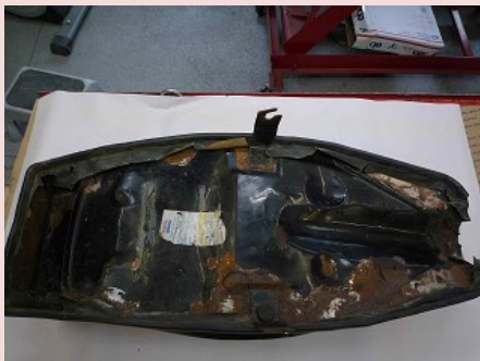
Highrider seat base