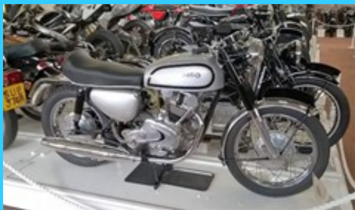
This engine was made to replace dominator twin in early sixties but project was abandoned . Its a prototype later rebuilt. Think it is a 650.