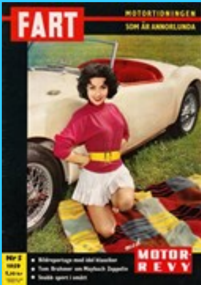
Fart means speed in Swedish. This is a real magazine from the 60s and 70s.