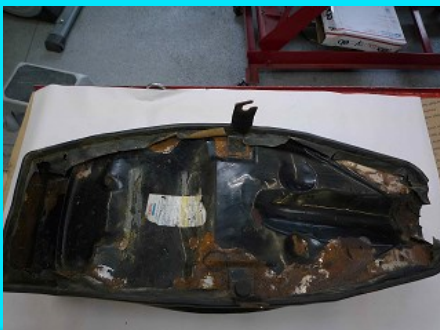
Highrider seat base