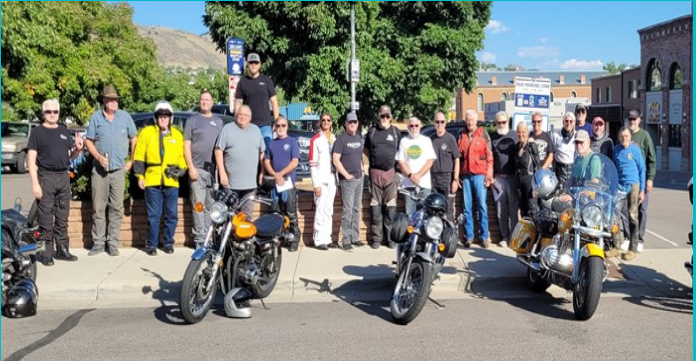
OBR 21 Group Photo